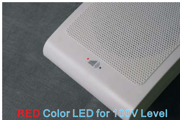
RED Color LED for 100V Level