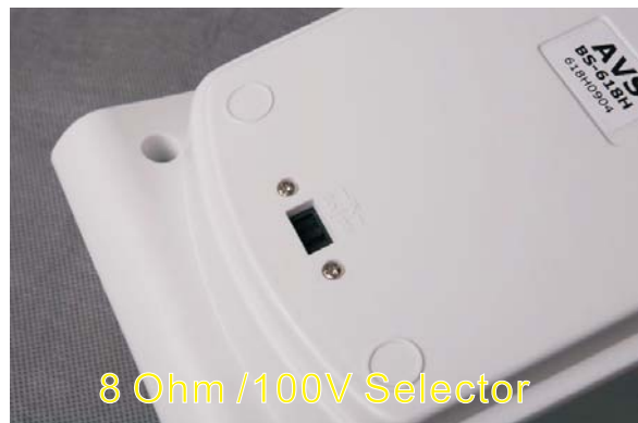
8 Ohm / 100V Selector