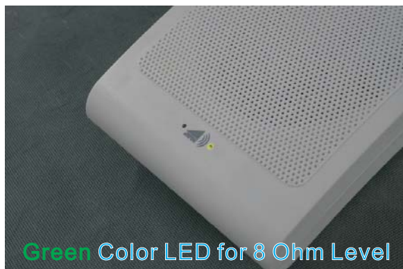
Green Color LED for 8 Ohm Level