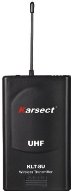
! KLT-8U BODYPACK TRANSMITTER