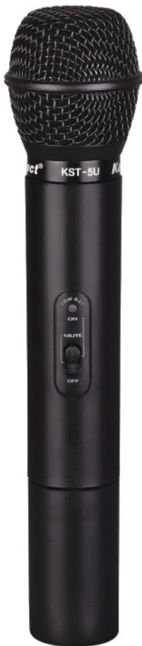
! KST-5U HANDHELD TRANSMITTER

RF Frequency Range:460-970MHz RF Output:>10dBm Modulation Type:FM Max Deviation:± 40KHz Spurious Emission:>53dBc Nominal Current Drain:<40mA Power Requirements:9V DC Dimensions:10.5x6.5x2.5cm