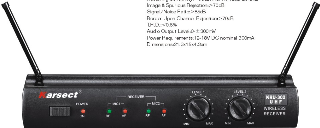
! KRU-302 DUAL CHANNEL RECEIVER

RF Frequency Range:460-970MHz Receiving Sensitivity:-105dBm(S/N:-12dB 25KHz) Image & Spurious Rejection:>70dB Signal/Noise Ratio:>85dB Border Upon Channel Rejection:>70dB T.H.D.:<0.5% Audio Output Level:0-±300mV Power Requirements:12-18V DC nominal 300mA Dimensions:21.3x15x4.3cm