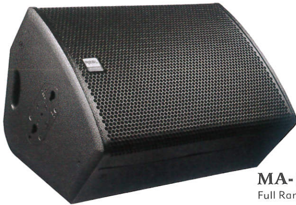
MA-15 Full Range