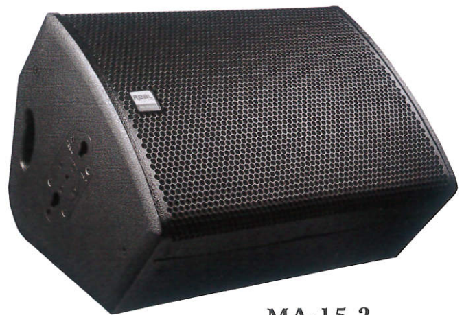
MA-15.2 Full Range

The MA-15.2 is a 2-way full range loudspeaker system. Includes a 15inch LF driver and a 2inch compression driver. The MA series provides a completed set of sound reinforcement instrument to satisfy the highest demands of audio professionals for both fixed installation and rental markets. The MA series delivers an ultimate sonic performance in a compact and multi-purpose package. Setting up MA enclosures is quick and easy due to the unique integrated flying hardware system which ensures precision, safety and full compatibility with current rigging safety standards. Its compact and wedge-shaped format makes MA series equally suitable to sound reinforcement applications such as front of house, floor monitor and distributed systems.